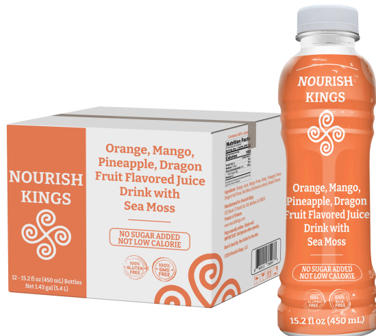
Orange, Mango, Pineapple, Dragon Fruit Flavored Juice Drink With Sea Moss - 12 Pack