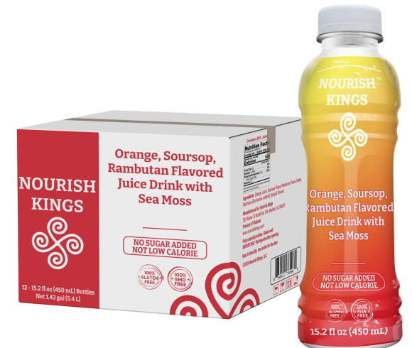
Orange, Soursop, Rambutan Flavored Juice Drink with Sea Moss - 12 Pack