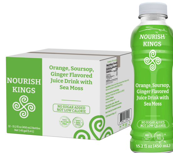
Orange, Soursop, Rambutan Flavored Juice Drink with Sea Moss - 12 Pack