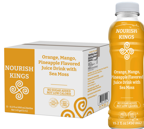
Orange, Mango, Pineapple, Dragon Fruit Flavored Juice Drink With Sea Moss - 12 Pack