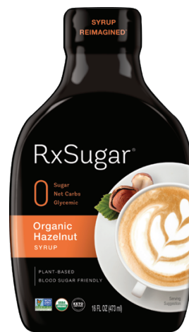
Organic Hazelnut Syrup