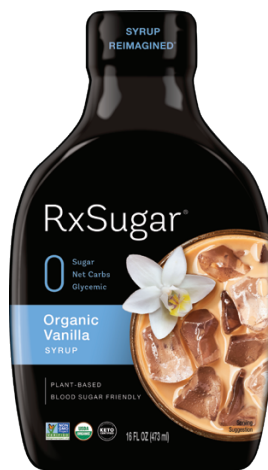
Organic Vanilla Syrup