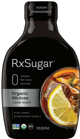
Organic Liquid Sugar