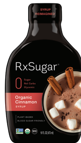
Organic Cinnamon Syrup