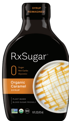
Organic Caramel Syrup