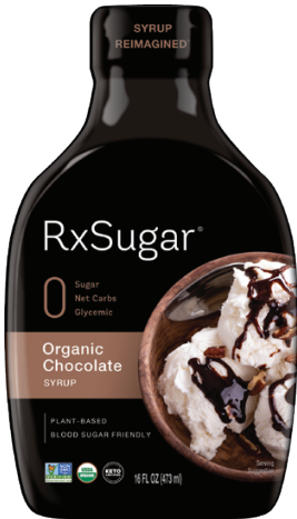
Organic Chocolate Syrup