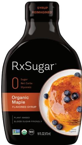
Organic Pancake Syrup