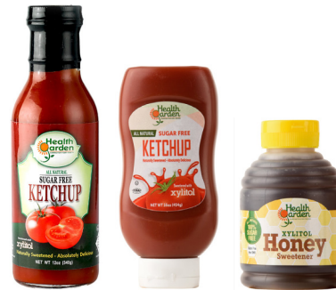
Sugarless Ketchup & Honey