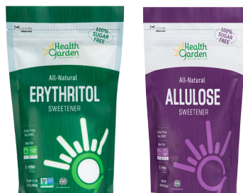
Erythritol & Allulose