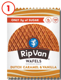
DUTCH CARAMEL & VANILLA