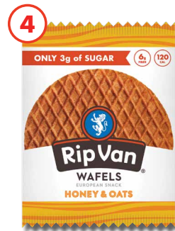
HONEY & OATS