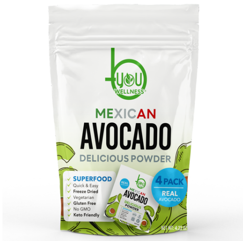
AVOCADO POWDER SACHETS