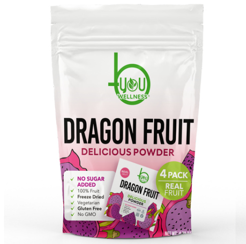
DRAGON FRUIT POWDER SACHETS