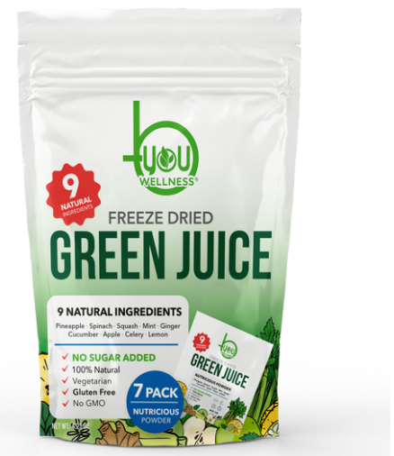
GREEN JUICE POWDER SACHETS