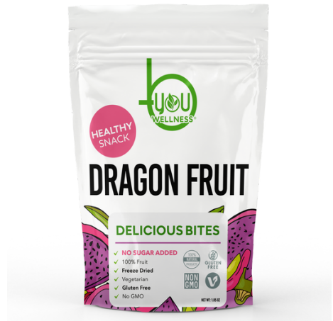
DRAGON FRUIT BITES