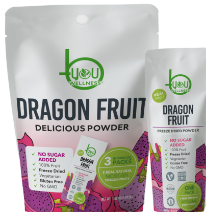
DRAGON FRUIT POWDER SACHETS