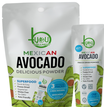
AVOCADO POWDER SACHETS