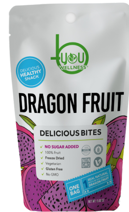
DRAGON FRUIT BITES