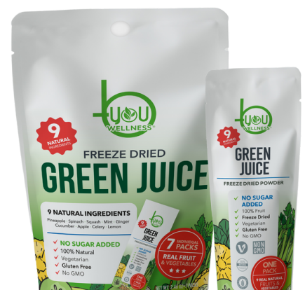
GREEN JUICE POWDER SACHETS