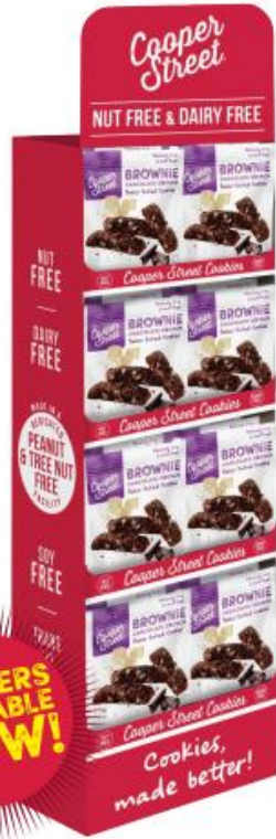
24 ct Display Shipper