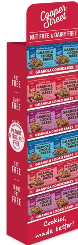
36 ct Display Shipper 6 ct Master Case Featuring Punch-Out For Floor Stack Display