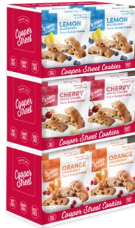
6 ct Master Case Featuring Punch-Out For Floor Stack Display