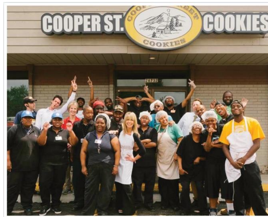
Original Bakery Founded 2011